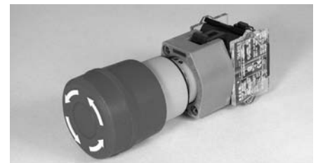
A 22.5 mm switch must be durable and rugged.

Robust, heavy-duty construction is the hallmark of the original 22.5 mm switches. Many, like the EAO Series 04 E-Stops, have stackable contact blocks, optional key release actuators, and mounting options for 22.5 mm panel openings. This EAO series is rated at up to 10 A, 600 VAC, has silver contacts with available gold over silver or silver over palladium contacts, and silver-plated screw terminals with available quick-connect terminals.