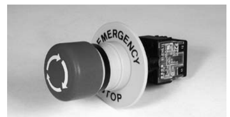
Today's applications often require a slimmer footprint.

Modern applications often demand a slimmed down E-Stop with 16 mm mounting. Innovative products, like the EAO Series 61, are now available with an actuator shape that prevents blockage from foreign objects, a black indicator ring visible from long distances, and available key release actuators. This EAO series is rated at 5 A, 250 VAC, and has a choice of silver or gold contacts, screw or solder quick-connect terminals.