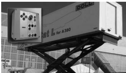
E-Stops can be mounted on a console or on a wireless pendant.

These large lifting and moving devices may have a gantry mounted cab which includes an E-Stop on the operator console. Smaller overhead cranes usually have a wired or wireless pendant control operated from ground level. The pendant includes an E-Stop. The chief regulating body for these massive devices is the Occupational Safety and Health Administration. OSHA 29 CFR 1910.179 (a)(59) defines “emergency stop switch” as a manually or automatically operated electric switch to cut off electric power independent of the regular operating controls. Another section, 9 CFR 1910.179(a)(61) defines “main switch” as a device controlling the entire power supply to the crane.