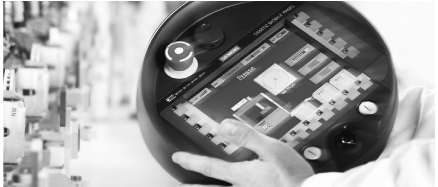
An E-Stop must be initiated by a single human action using a manual control device.

It is then useful to construct or consult an existing E-Stop series selector chart (often supplied by vendors). For example, EAO provides a chart that allows easy comparison of key design factors (see Figure 2). You can select panel