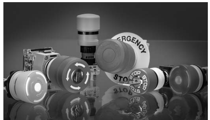
E-Stops are critical to the human machine interface (HMI).

Resetting the electrical system can only be done by first releasing the E-Stop that was originally activated. If E-Stops were activated at multiple locations, all must be released before machinery