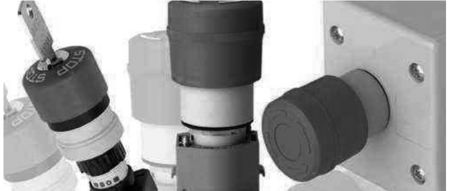
Once you understand the E-Stop function and relevant standards, codes, and compliances you can determine the appropriate device.

One area of current interest is making sure that the E-Stop itself will “failsafe” should the actuator and contact block be separated. The contact block has normally closed contacts that allow power to flow to the machinery. Pushing