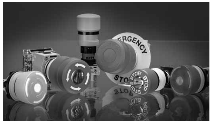
E-Stops are critical to the human machine interface (HMI).

Resetting the electrical system can only be done by first releasing the E-Stop that was originally activated. If E-Stops were activated at multiple locations, all must be released before machinery