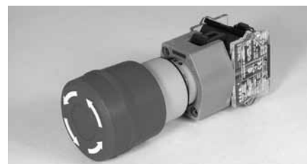
A 22.5 mm switch must be durable and rugged.

Robust, heavy-duty construction is the hallmark of the original 22.5 mm switches. Many, like the EAO Series 04 E-Stops, have stackable contact blocks, optional key release actuators, and mounting options for 22.5 mm panel openings. This EAO series is rated at up to 10 A, 600 VAC, has silver contacts with available gold over silver or silver over palladium contacts, and silver-plated screw terminals with available quick-connect terminals.