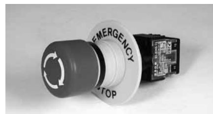
Today's applications often require a slimmer footprint.

Modern applications often demand a slimmed down E-Stop with 16 mm mounting. Innovative products, like the EAO Series 61, are now available with an actuator shape that prevents blockage from foreign objects, a black indicator ring visible from long distances, and available key release actuators. This EAO series is rated at 5 A, 250 VAC, and has a choice of silver or gold contacts, screw or solder quick-connect terminals.