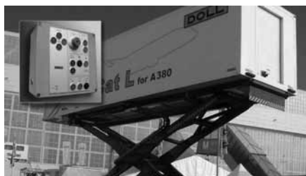
E-Stops can be mounted on a console or on a wireless pendant.

These large lifting and moving devices may have a gantry mounted cab which includes an E-Stop on the operator console. Smaller overhead cranes usually have a wired or wireless pendant control operated from ground level. The pendant includes an E-Stop. The chief regulating body for these massive devices is the Occupational Safety and Health Administration. OSHA 29 CFR 1910.179 (a)(59) defines “emergency stop switch” as a manually or automatically operated electric switch to cut off electric power independent of the regular operating controls. Another section, 9 CFR 1910.179(a)(61) defines “main switch”