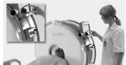
Medical imaging E-Stops are closely regulated.

section 40, which requires accessible emergency stop switches and keyed lock-out switches to disable the system.