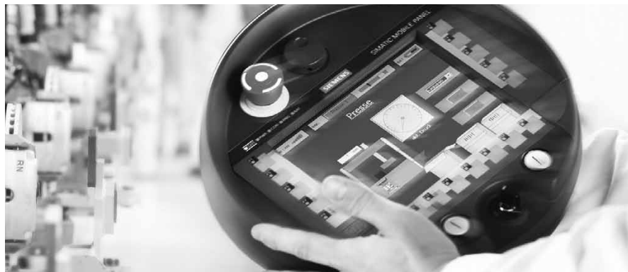
An E-Stop must be initiated by a single human action using a manual control device.

It is then useful to construct or consult an existing E-Stop series selector chart (often supplied by vendors). For example, EAO provides a chart that allows easy comparison of key design factors (see Figure 2). You can select panel